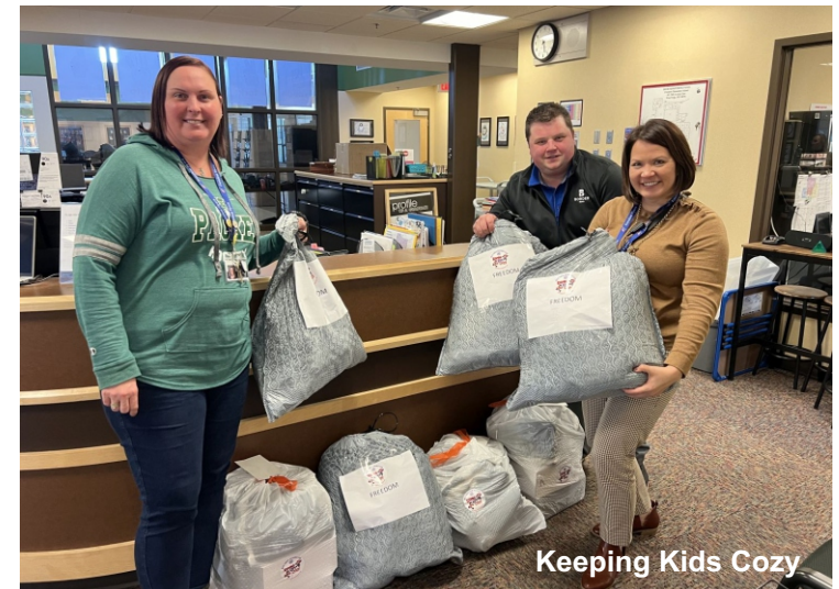
Keeping Kids Cozy